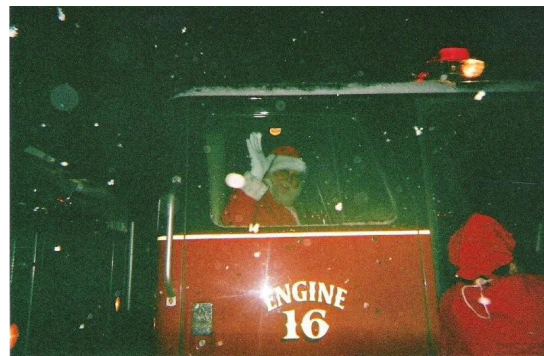
Santa & Mrs. Claus arriving by Fire Truck