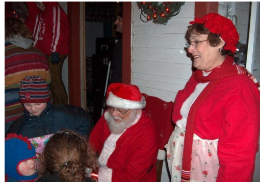
Santa & Mrs. Claus handing out gifts.