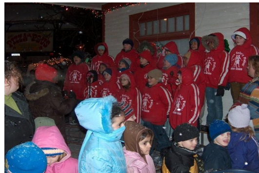
Pullman Safety Patrol Caroling